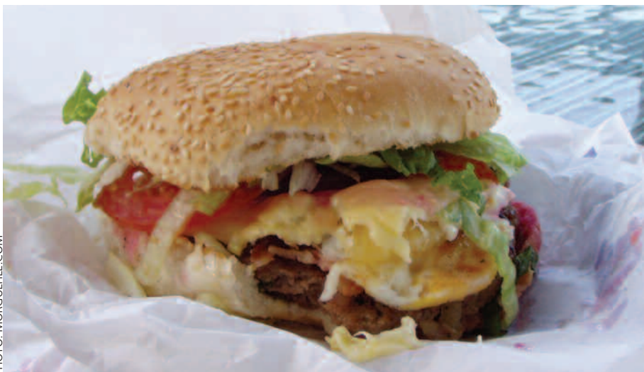
• Above and below: A balanced diet with careful carb and fat control is the key to both avoidance and management of type 2 diabetes. Ration those burgers!

Given the increasing numbers of divers diving with diabetes, the question of instructing with the disease was bound to arise. When considering this problem, the over-riding concern must be the duty of care